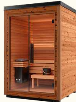
MIRA S in natural cladding