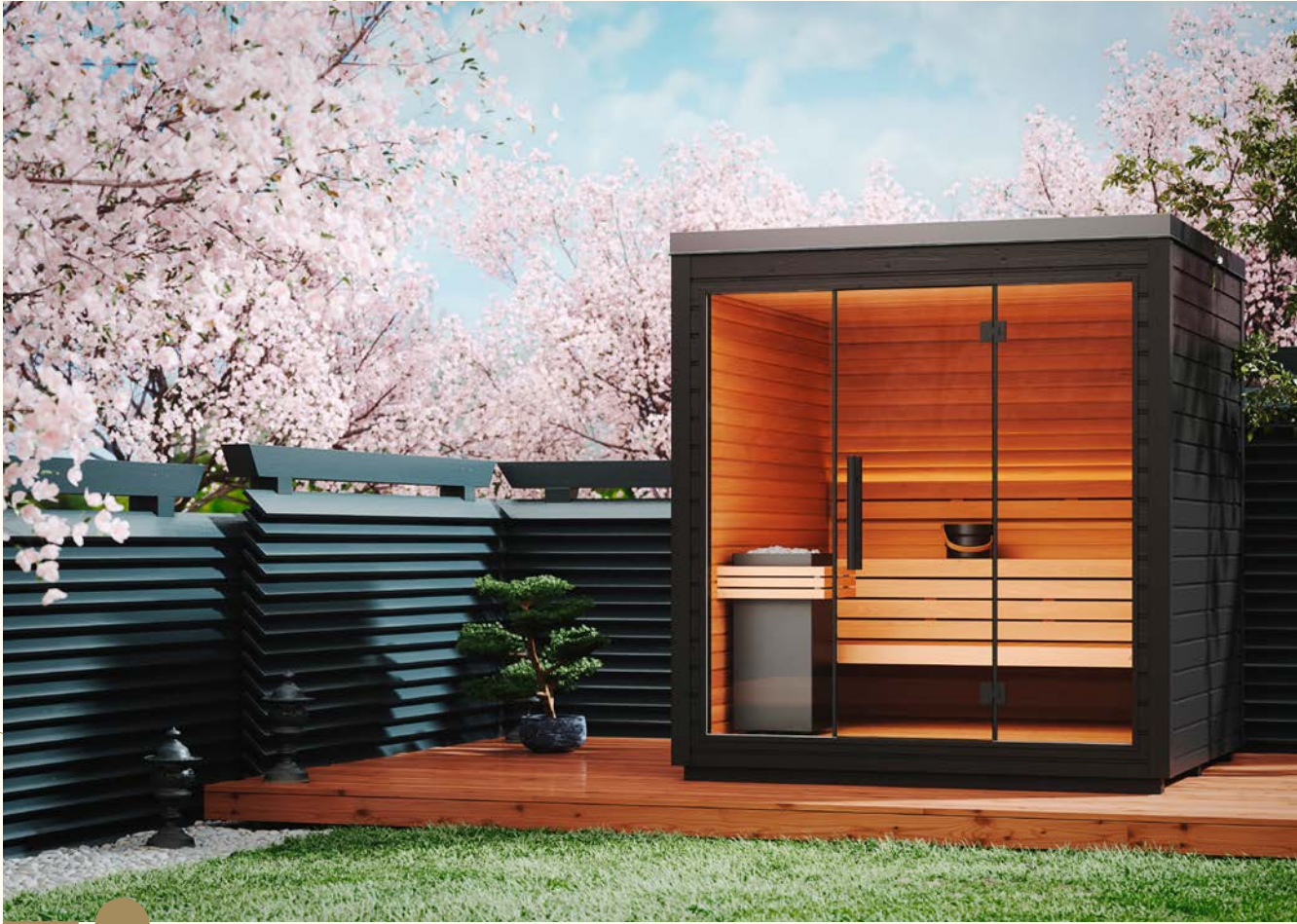
Mira model L in black cladding