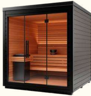
MIRA L in black cladding