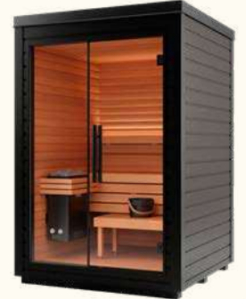
MIRA S in black cladding