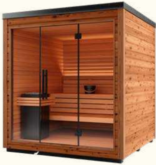
MIRA L in natural cladding